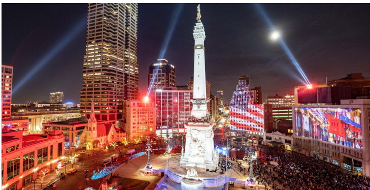
Photo: Shining A Light

Seasonal celebrations, nightly lighting presentations, arts/cultural performances and patriotic salutes, throughout the year.