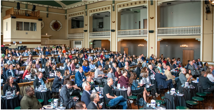
Photo: State of Downtown Presented by JP Morgan Chase