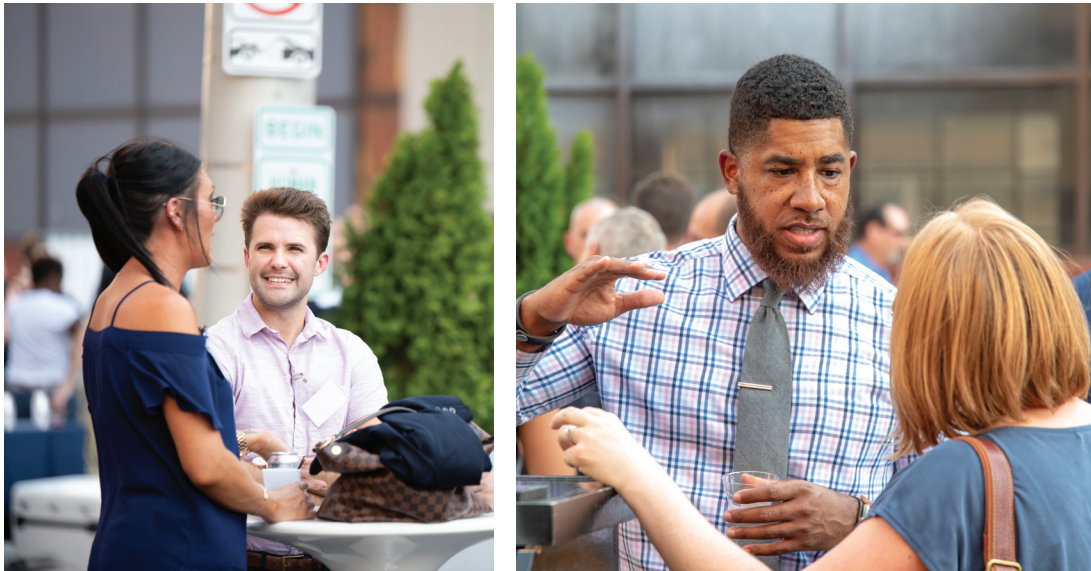
Top Photos: Exclusively designed t-shirt. Bottom Photos: DII 25th Anniversary Silver Shindig 2018.

Patrons contribute to Downtown's future and get some pretty great perks: