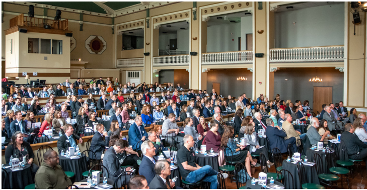
Photo: State of Downtown Presented by JP Morgan Chase